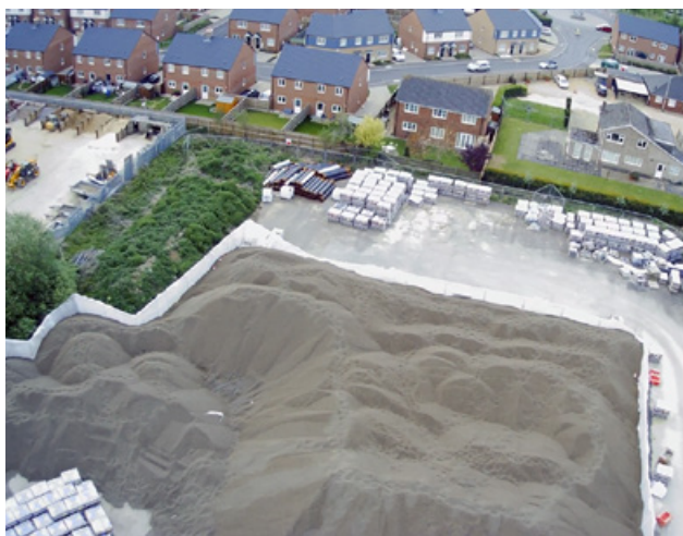
The project minimized environmental impact by sourcing LECA LWA from a location less than 10 miles away

The direct transportation of Leca LWA from a site less than 10 miles away reduced the need for extensive trucking, thereby minimizing road mileage.