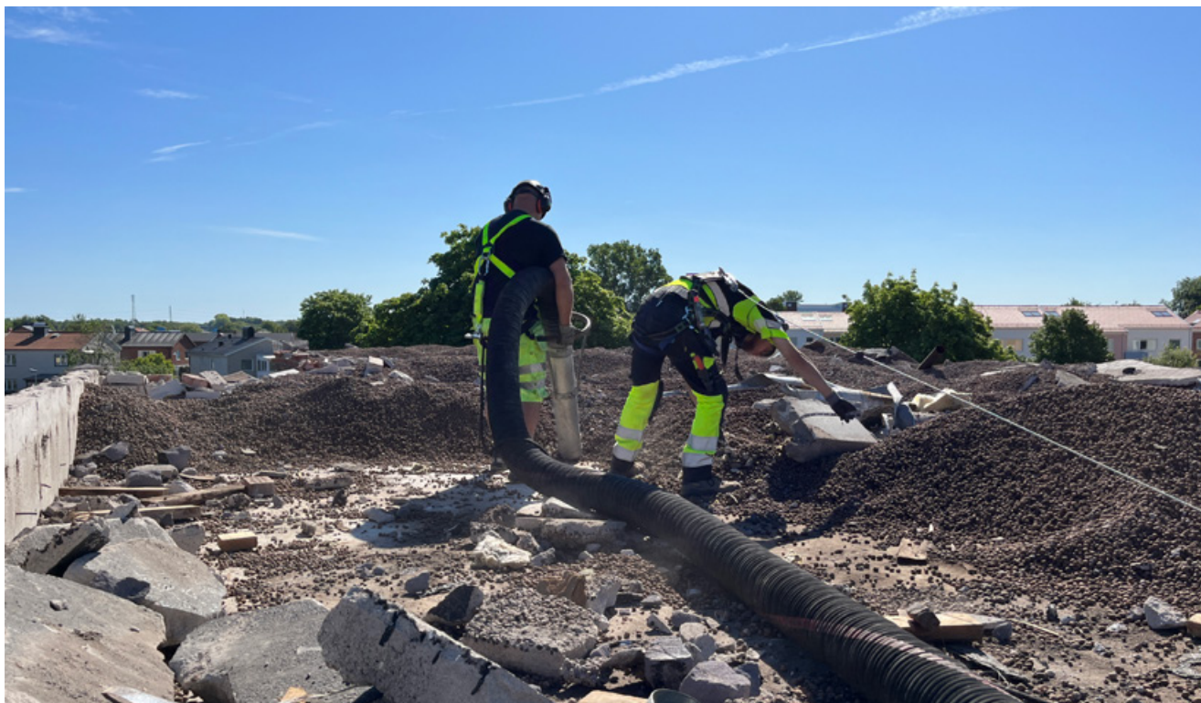
The lightweight aggregate in the roof from the 60's was analyzed and could be reused.