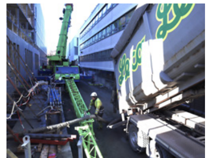
Cramped conditions on the construction site are no obstacle when the filler can be blown into place with long hoses