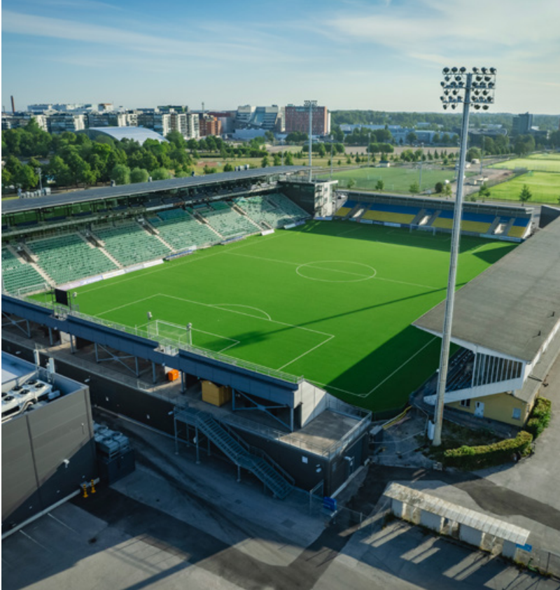
Veritas Stadion is an international standard football stadium situated in Turku.