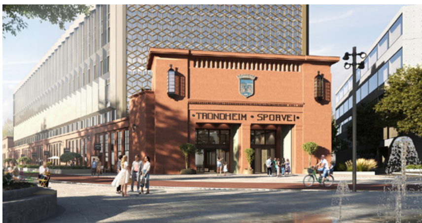
In addition to being Trondheim’s largest office workplace, “Teknostallen” will also contain a fitness center, shops, restaurants and a 3,000 m 2 glassed-in year-round garden, eateries and a 3000 m 2 glassed-in year-round garden (Illustration: KLP Eiendom)