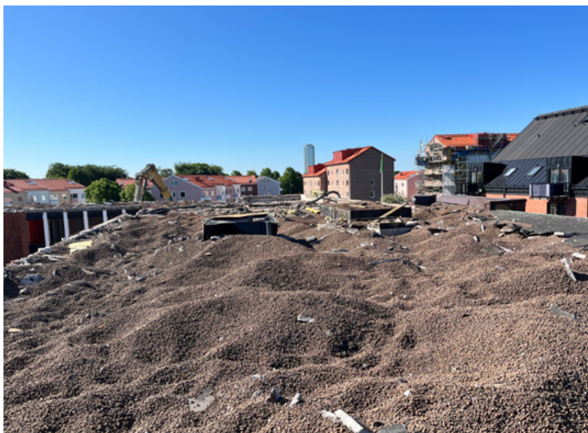
One person operated the suction hose and one person removed concrete pieces that were not to be vacuumed up.

When the vacuum truck was full, the driver could simply move a few meters away and dump the vacuumed Leca LWA. In total, about 500 cubic meters of Leca lightweight aggregate were repurposed for reuse. Beyond the reuse of Leca LWA, bricks from the old buildings will also be reused, and solar panels are to be installed on the roofs.