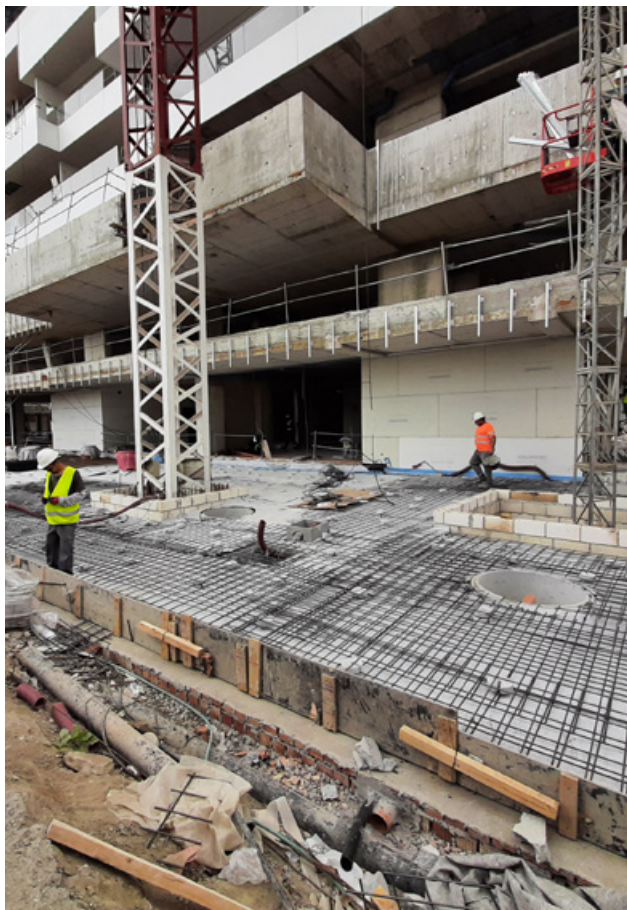
Arlita's core contains drainage pipes to prevent water accumulation and potential overloads

The lightweight fill, with thicknesses ranging from 0.8 to 1.5 m, was secured by double waterproofing. The first layer, beneath the Arlita, seals the parking slab, while the second, atop the concrete slab, ensures drainage and leak protection. Arlita's core contains drainage pipes to prevent water accumulation and potential overloads on the parking slab.