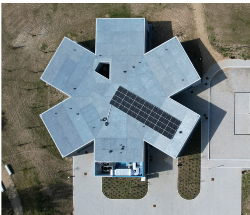
The center's star-shaped architecture, inspired by the six-pointed Life Star,