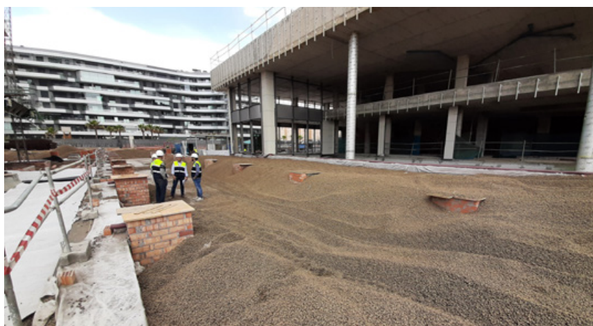
Arlita's core contains drainage pipes to prevent water accumulation and potential overloads

SACYR Construcción S.A. undertook the construction, requiring a daily fill of 600-700 m 3 , significantly reducing the number of trucks needed and thus lowering the CO 2 footprint and improving air quality. The compaction process involved one-meter layers compacted by small 6T tracked equipment, achieving the project's required performance with a single piece of equipment.