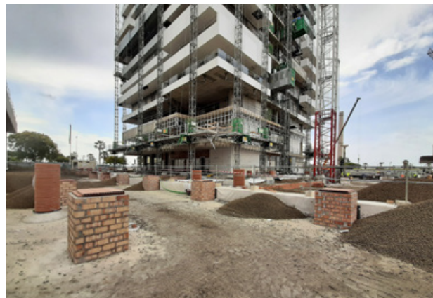
The landfill accommodates services, such as electricity, water, and wastewater