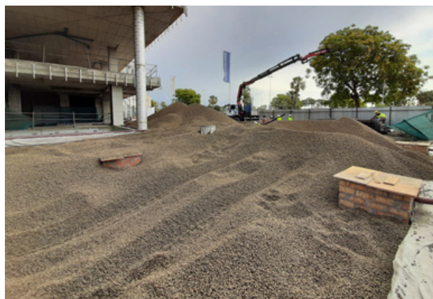
The lightweight fill, with thicknesses ranging from 0.8 to 1.5 m