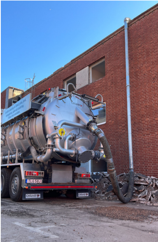
The truck was easily set up right next to the building.