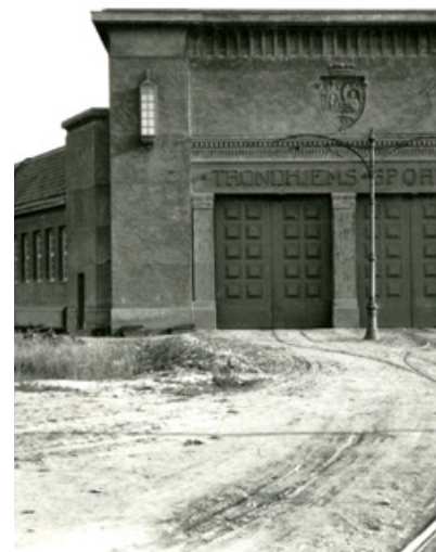
The old tram stables at Dalsenget in Trondheim were built in 1923. In 1956, large parts of the building burned down along with most of the rolling stock of what was then Trondheim Sporvei

Bye emphasizes the importance of high architectural quality in new additions, making “Teknostallen” a central feature in the new downtown area along Elgeseter gate, where the tramway stable will serve as a historical landmark. Lasse Volden of KLP Eiendom Trondheim highlights the project’s intention to preserve a piece of the city’s history while building a future-oriented workplace that integrates work, exercise, shopping, and socializing. However, integrating the tramway’s history with modern amenities added approximately EUR 1,7 million to the budget, invested in careful restoration to maintain the building’s unique character.