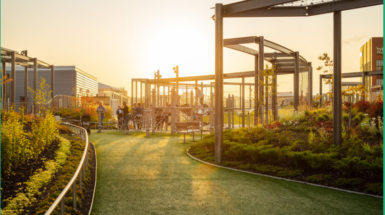
Text: Dakota Lavento