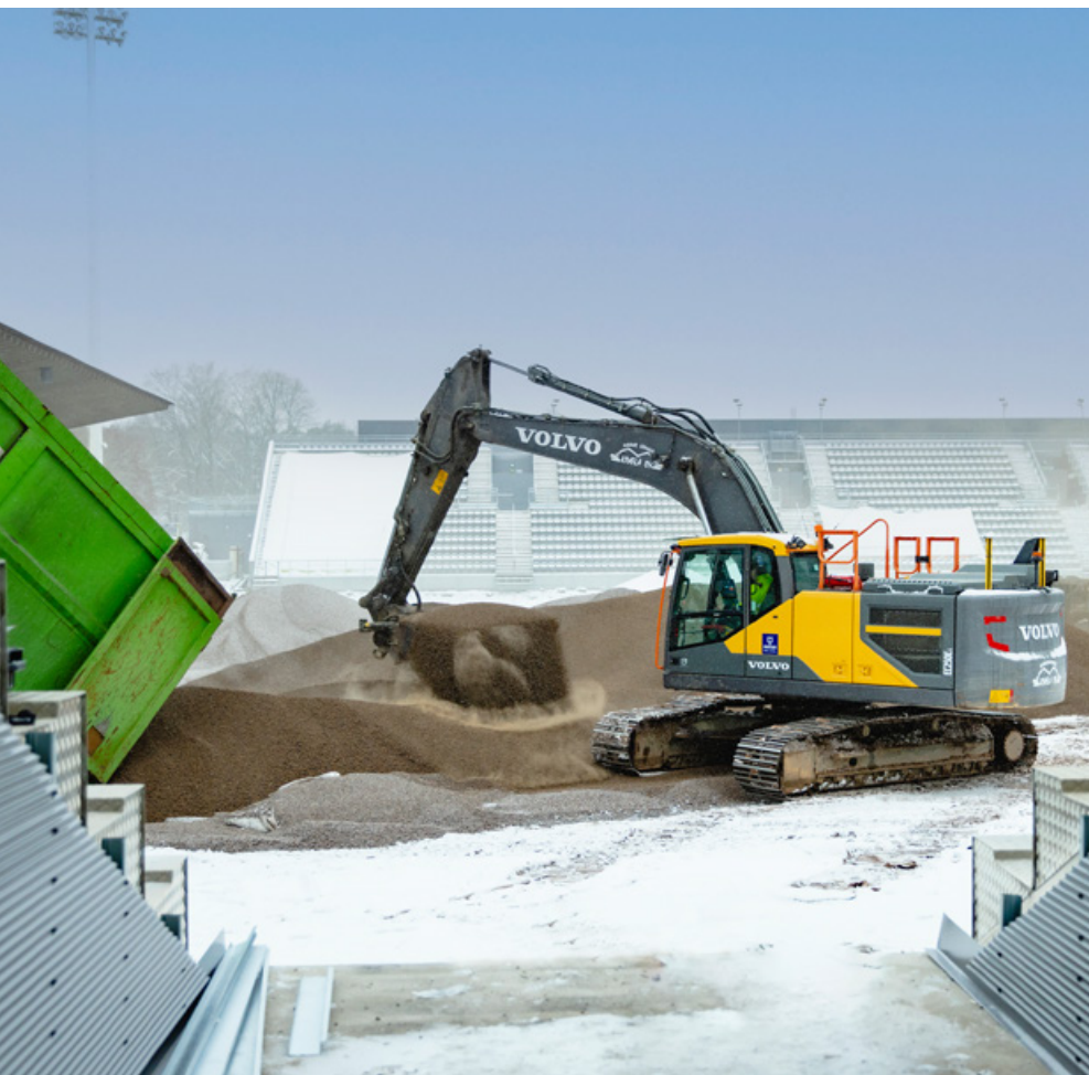
A 10-30 cm layer of Leca LWA was added on top of the old lightweight fill.