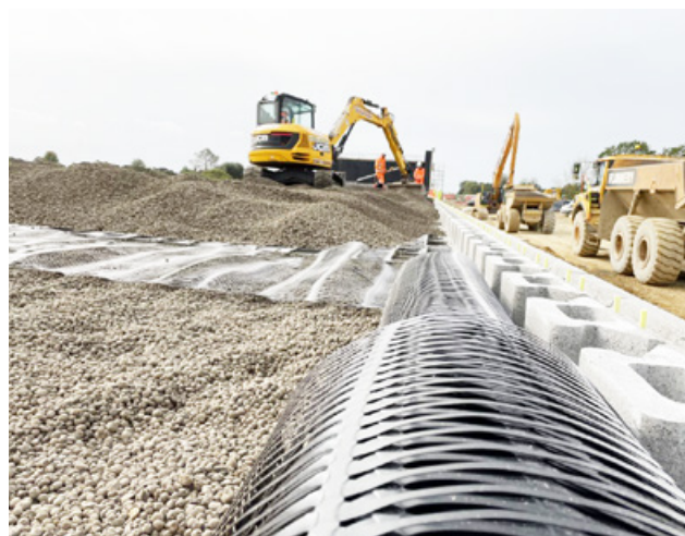
Innovation Meets Infrastructure: The Synergy of LECA LWA and the Tensar Grid System in Spalding