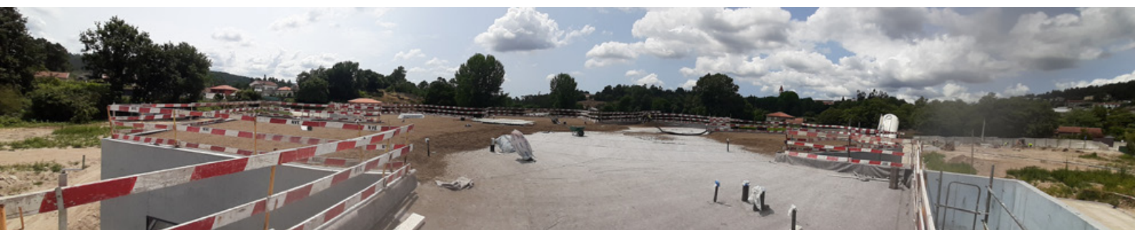
Approximately 250 m 3 were applied to the building's roof through direct pumping.

The construction, led by NVE Engenharias, is a collaborative effort between the Northern Regional Health Administration and the Municipality of Guimarães, with additional funding from the Northern Regional Coordination and Development Commission (CCDR-N) under the Northern Portugal Regional Operational Programme 2020. This investment highlights the project's significance not only to Moreira de Cónegos but to the broader Northern Portugal region. The new Health Centre is more than just a building; it is a symbol of the Municipality of Guimarães' dedication to improving healthcare accessibility and enhancing the well-being of its community, marking a pivotal advancement in regional healthcare services.