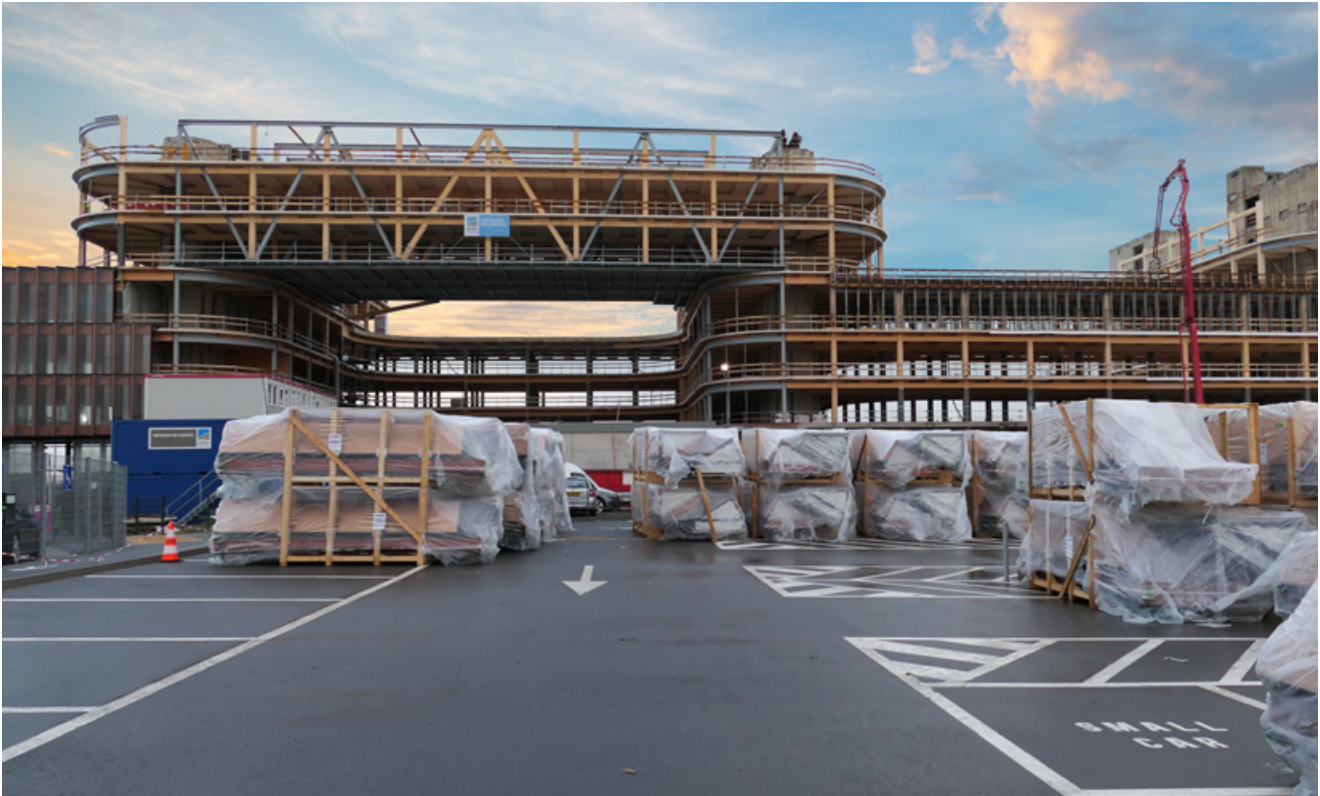
The Skypark Business Centre at Luxembourg's Aitport is currently the largest timber construction in Europe