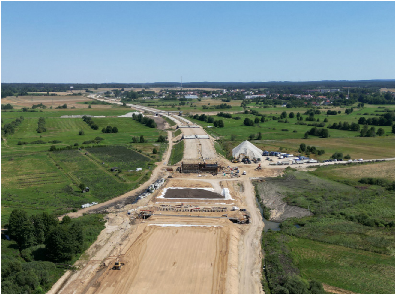
The S6 expressway connects Szczecin and Gdańsk in northern Poland