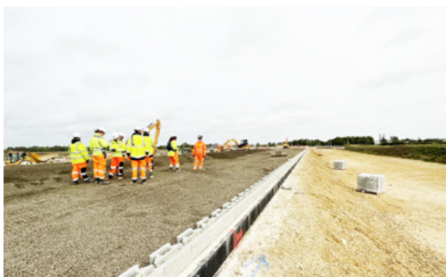
Initiated in January 2022, aims to connect major roads and improving traffic flow

Leca product: 28.000 m 3 Leca® LWA 10-20