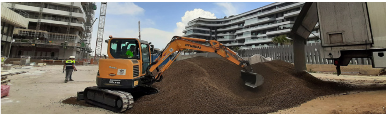
Arlita reduced the number of trucks needed - lowering the CO 2 footprint

Málaga, one of Spain's most beautiful cities, has been undergoing rapid transformation. This project is set to become a new benchmark for high-quality living - with apartments priced up to EUR 3.5 million. Estudio Lamela Arquitectos is committed to providing a high-quality product, emphasizing sustainability and environmental respect.