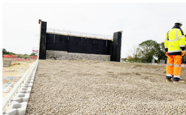
The use of LECA LWA in areas with poor ground conditions near waterways has proven to improve ground stability